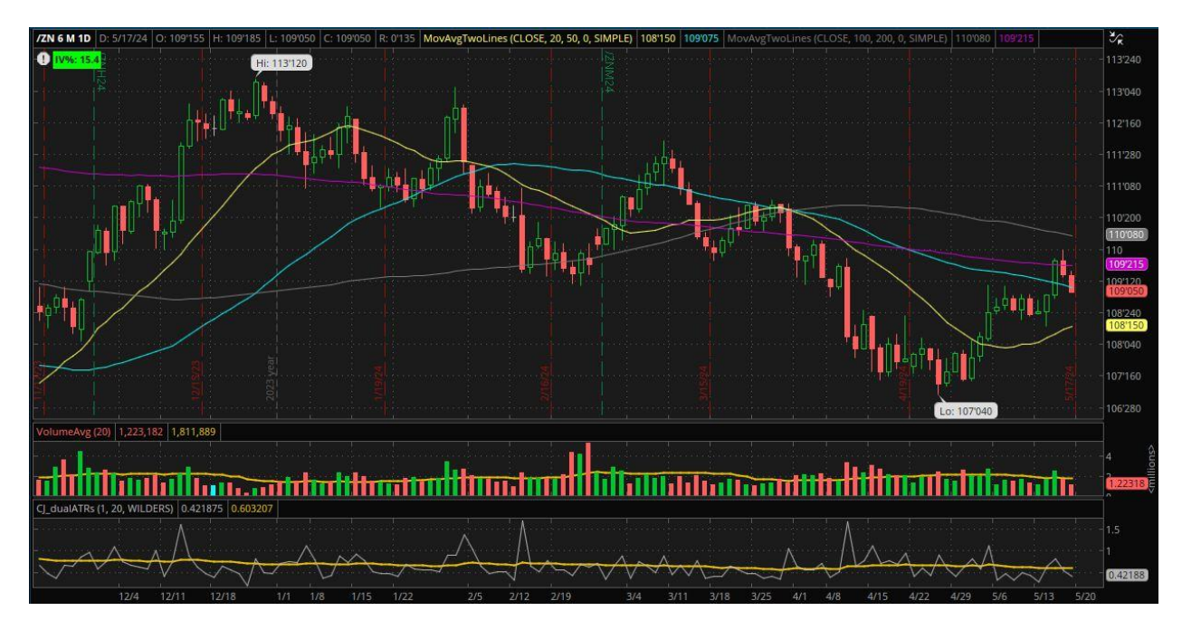
US 10 year Treasury daily chart as of May 17, 2024 - The 10 year Treasury paused Monday and Tuesday then rallied Wednesday above its 50 day and 200 day SMAs. Thursday saw a higher high before dropping back below its 200 day SMA. Friday saw a decline back below its 50 day SMA.