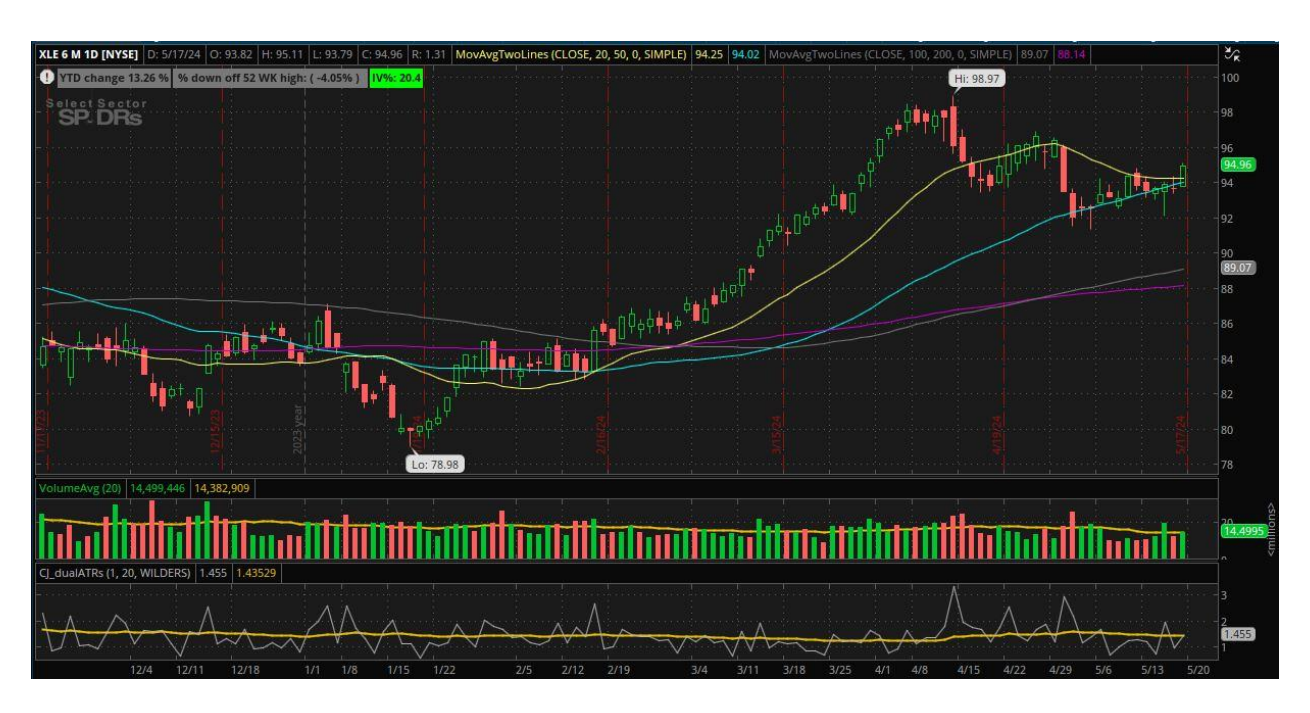
XLE daily chart as of May 17, 2024 - The Energy sector declined Monday to its 50 day SMA then was mostly horizontal the next 3 days before the rally on Friday above its 50 day and 20 day SMAs, ending the week up +1.20%.

Dow Transportation Index daily chart as of May 17, 2024 - The Dow Transports rallied on Monday and gapped up on Tuesday before selling off lower the rest of the day on Tuesday and the rest of this week, ending this week down -0.62%.