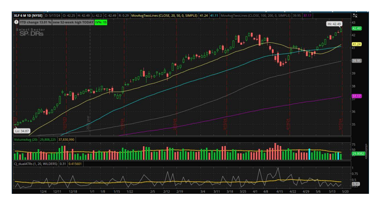
XLF daily chart as of May 17, 2024 - The Financial sector saw a small decline Monday then resumed its rally the rest of this week, ending the week up +1.58% and delivering new all time highs on Friday.