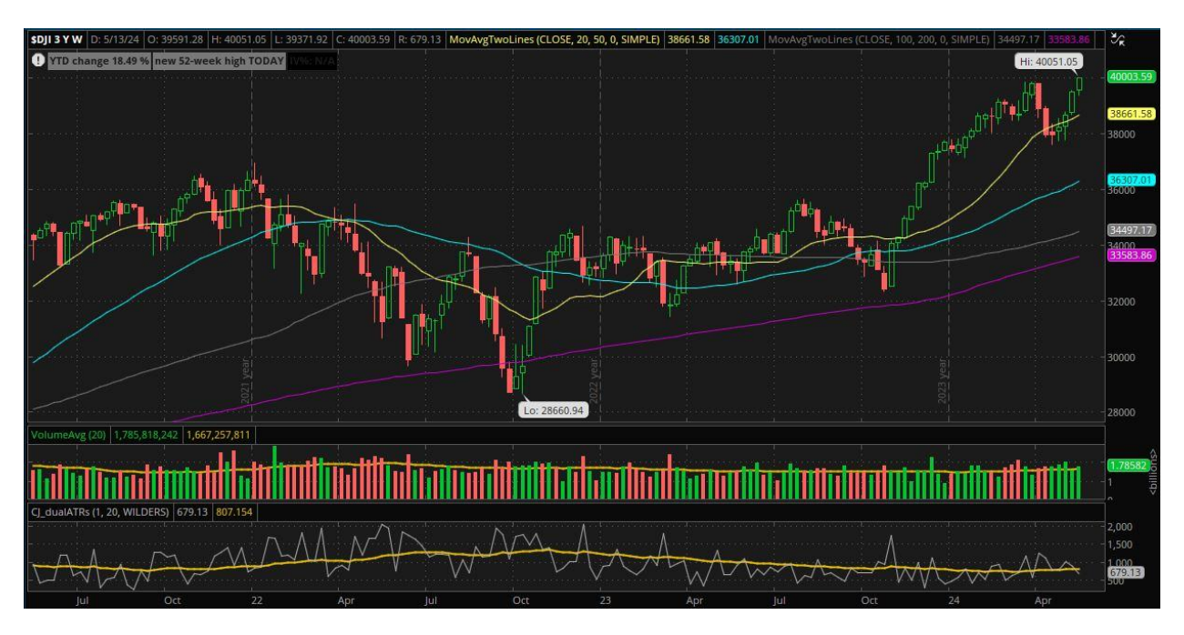
DJIA weekly chart as of May 17, 2024 - Here we see a 4^{th} week of rally that has fully recovered the April dip below the 20 week SMA and delivered new all time highs this week.