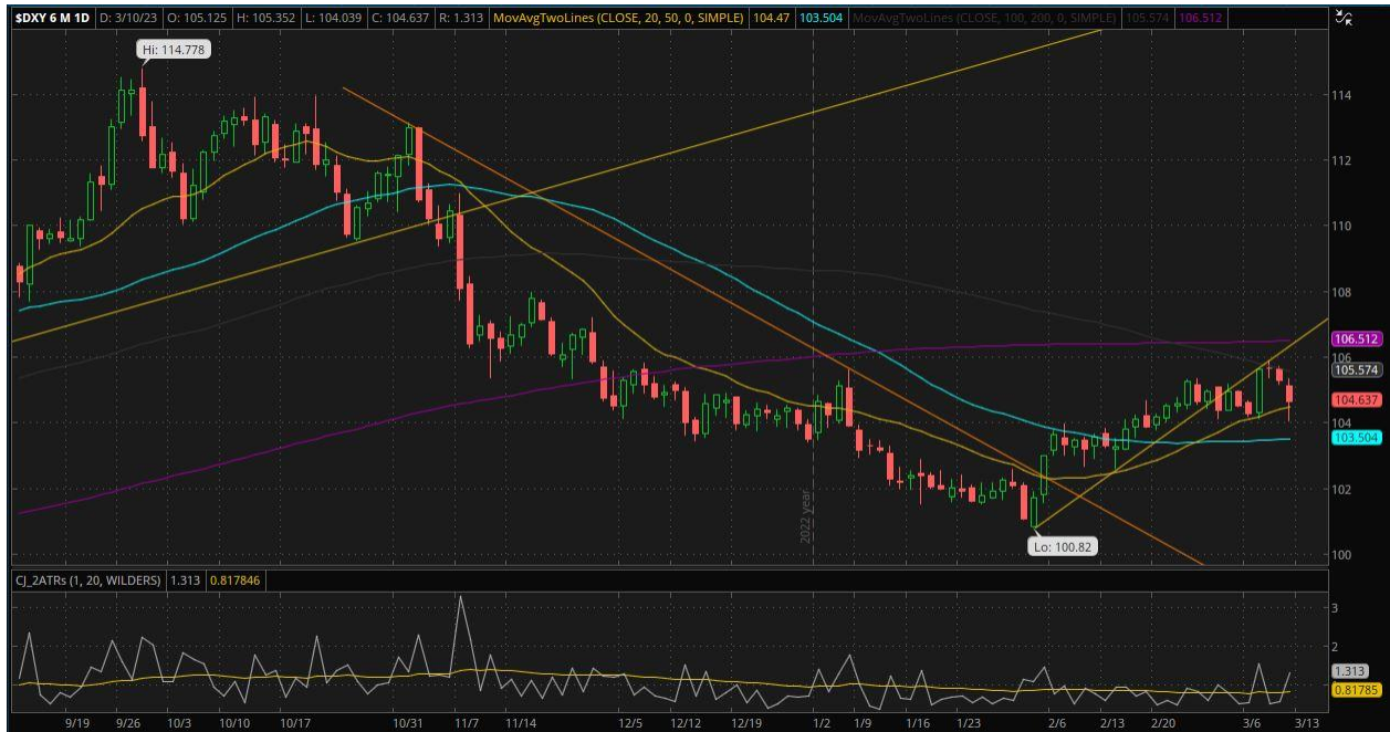
US Dollar Index daily chart as of Mar 10, 2023 - The Dollar oscillated this week, down Monday, up strong Tuesday, paused Wednesday then declined Thursday and Friday.