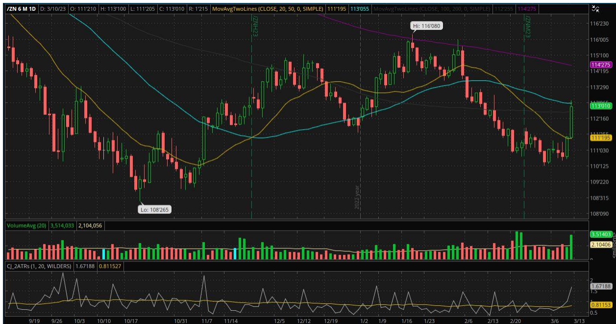
US 10 year Treasury daily chart as of Mar 10, 2023 - The US 10 year Treasury drifted lower the first 3 days this week then saw strong buying Thursday up to its 20 day SMA and stronger on Friday up to its 50 day SMA. This could also be where some money 'flowed' into late this week as it came out of stocks.