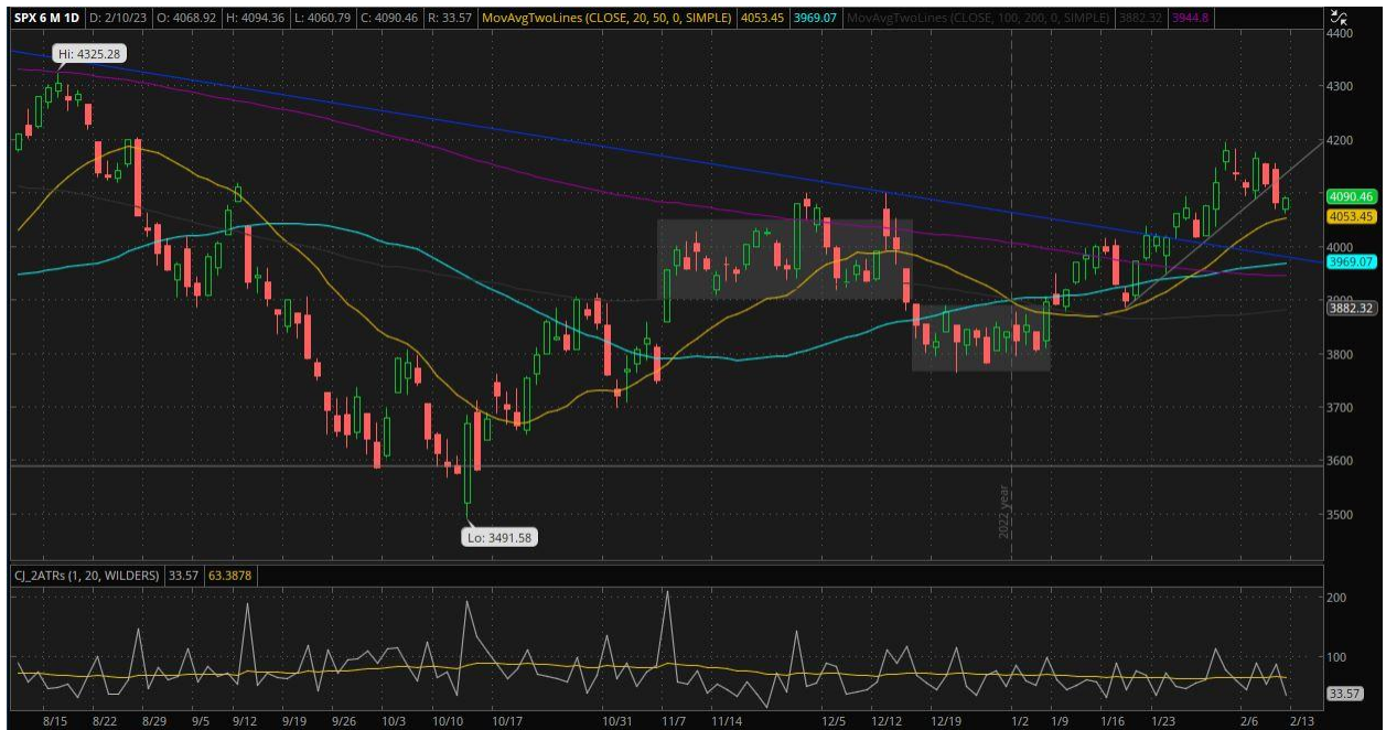
S&P 500 daily chart as of Feb 10, 2023 - On the daily chart we saw the break above the Resistance Trend Line (Dark Blue line) on Jan. 26 th . A Support Trend Line (Grey line) drawn between the lows this year we see was respected on Tue. and Wed. this week, but was broken below on Thursday. Friday saw a dip that nearly reached the 20 day SMA, ending the week down -1.11% and still above all 3 of its key SMAs.