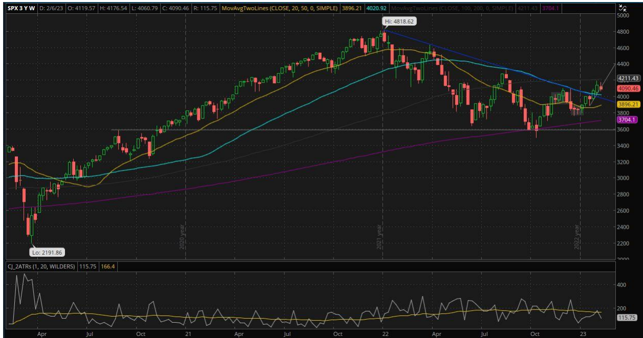
S&P 500 weekly chart as of Feb 10, 2023 - The rally the prior 2 weeks paused this week with a bearish 'Inside' week and remains above all 3 key Weekly SMAs.