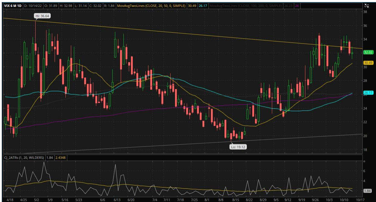
VIX daily chart as of Oct 14, 2022 - We saw a small increase in the VIX on Monday and Tuesday this week with a narrow pause on Wednesday. That is normal behavior for the VIX during a slow decline in the S&P. However, the large gap down and rally on Thursday did NOT send the VIX up huge at the open