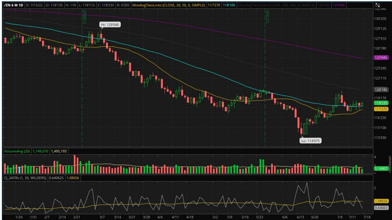
US 10 year Treasury daily chart as of Jul 15, 2022 - The 10 year rose above its 50 day SMA on Tuesday and remained in a narrow range the rest of this week.