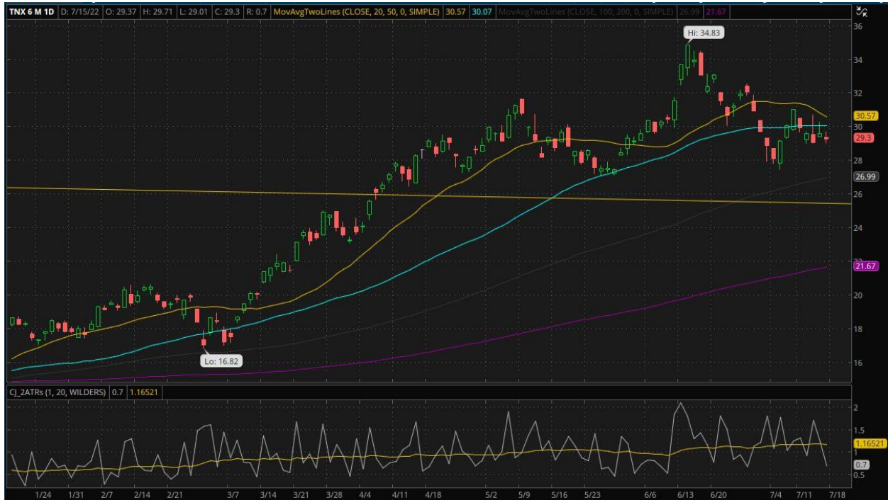
US 10 year Yield daily chart as of Jul 15, 2022 - The 10 year Yield dipped below its 50 day SMA on Tuesday and remained within a narrow range the rest of this week.