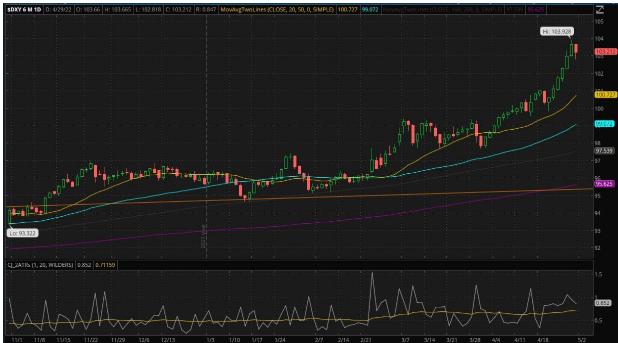
US Dollar Index daily chart as of Apr 29, 2022 - The US Dollar strengthened each day this week with a small pull back on Friday. Note the steeper incline this week as compared to the prior 2 weeks.