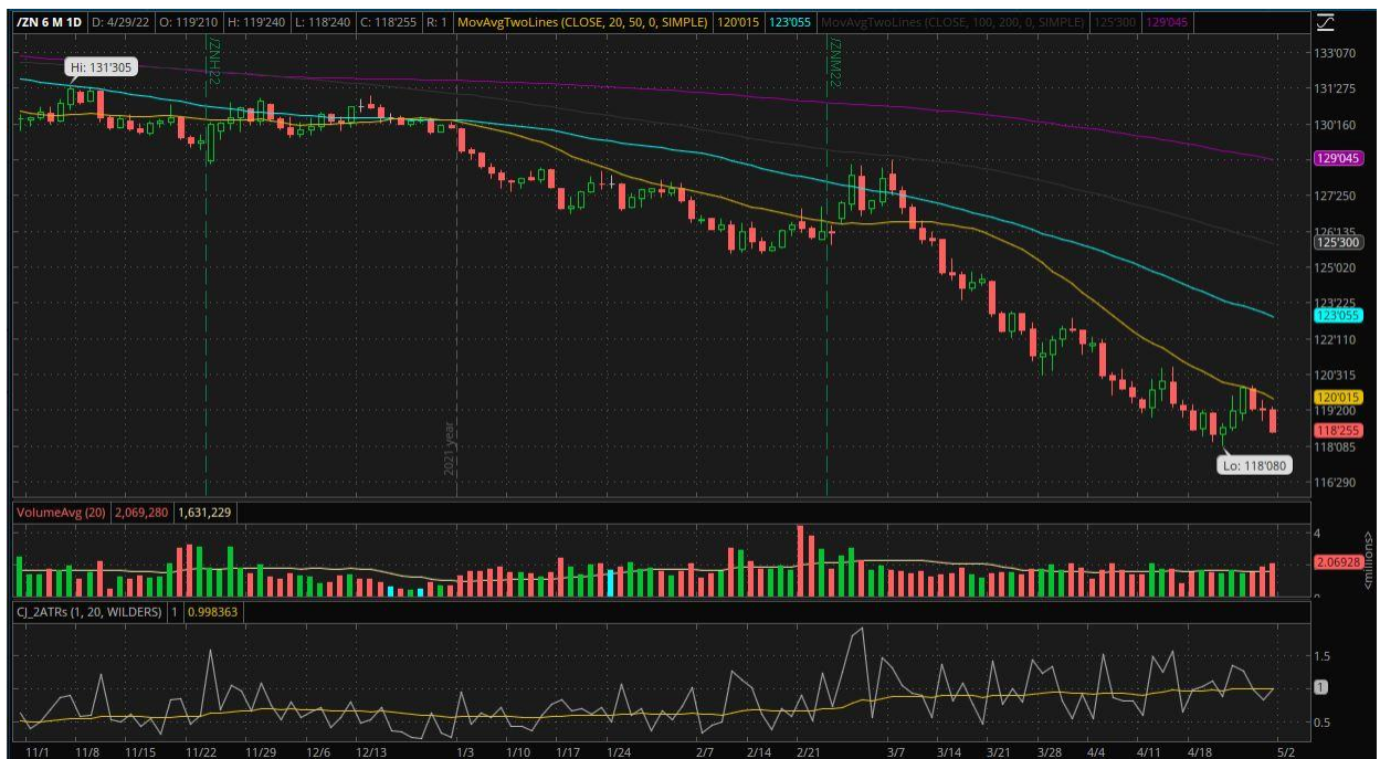
US 10 year Treasury daily chart as of Apr 29, 2022 - The 10 year Treasuries saw a failed rally Monday and Tuesday with the 20 day SMA acting like Resistance this week. Wednesday saw a decline followed by a pause on Thursday. Friday saw a steeper decline with stronger volume as the 10 year saw stronger selling.